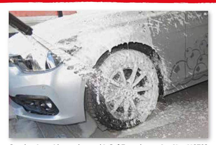
Car cleaning with attachment kit SoftFoam lance, Art. No. 410702