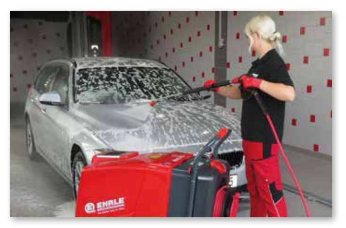
Car cleaning with lance and stainless steel flat jet nozzle