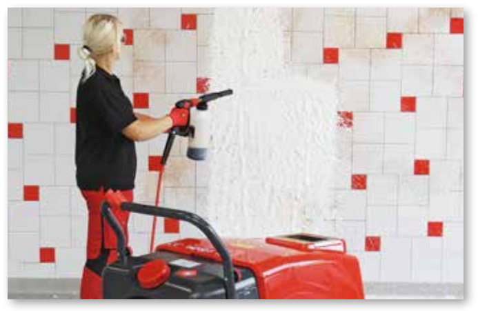
Pre-spray with attachment kit SoftFoam lance, Art. No. 410702