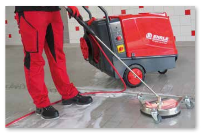
Area cleaner stainless steel in use Ø 300mm, Art. No. 394078