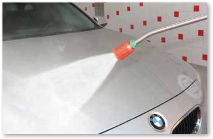
High pressure cleaning with lance and stainless steel flat jet nozzle