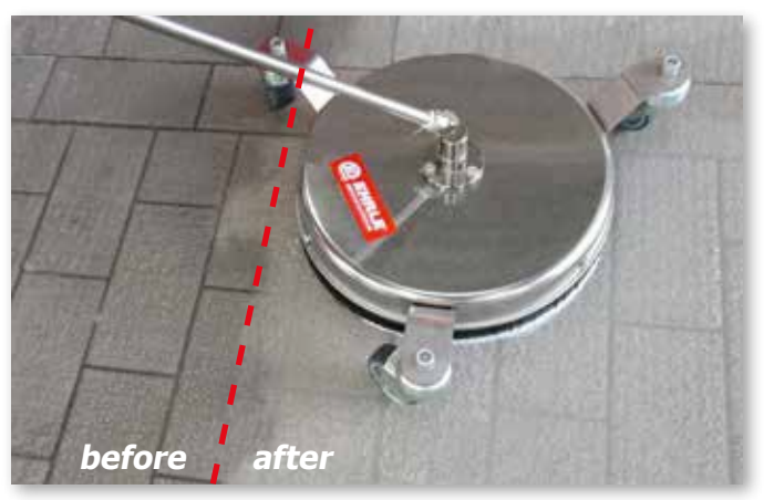
Area cleaner stainless steel Ø 410mm, Art. No. 394079