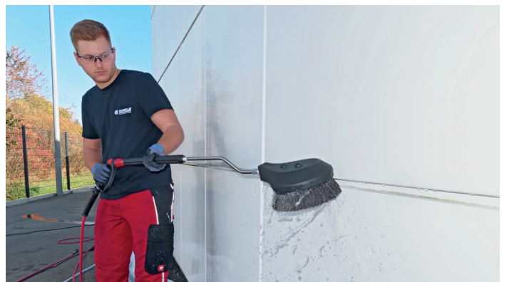
Rotating washing brush for difficult shapes 200 mm diameter, natural hair Art-Nr. 900156