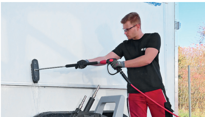
Surface washing brush for sensitive surfaces Washing width 300 mm, natural hair Art-Nr. 900155