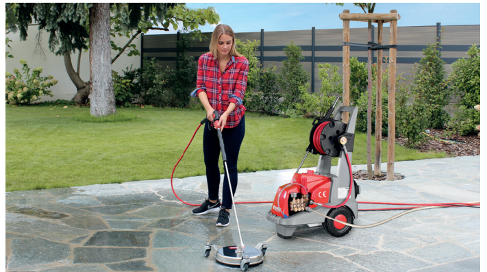
Floor surface cleaner made of stainless steel 300 mm diameter Art-Nr. 394078