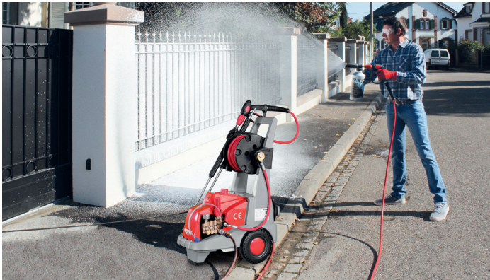
Foam lance with vario nozzle and 2 ltr chemical container Art-Nr. 410702