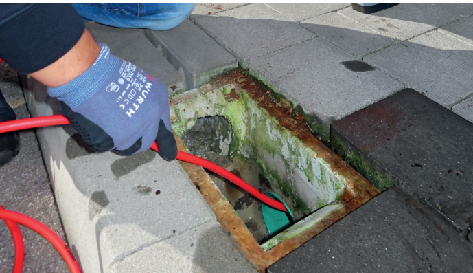
Pipe cleaning hose with spray jet and propulsion 15 m Art-Nr. 911119