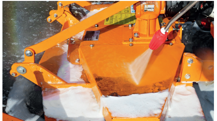
Rotating nozzle with stainless steel jet pipe (included in standard scope of delivery for KD523 Premium) Art-Nr.900181